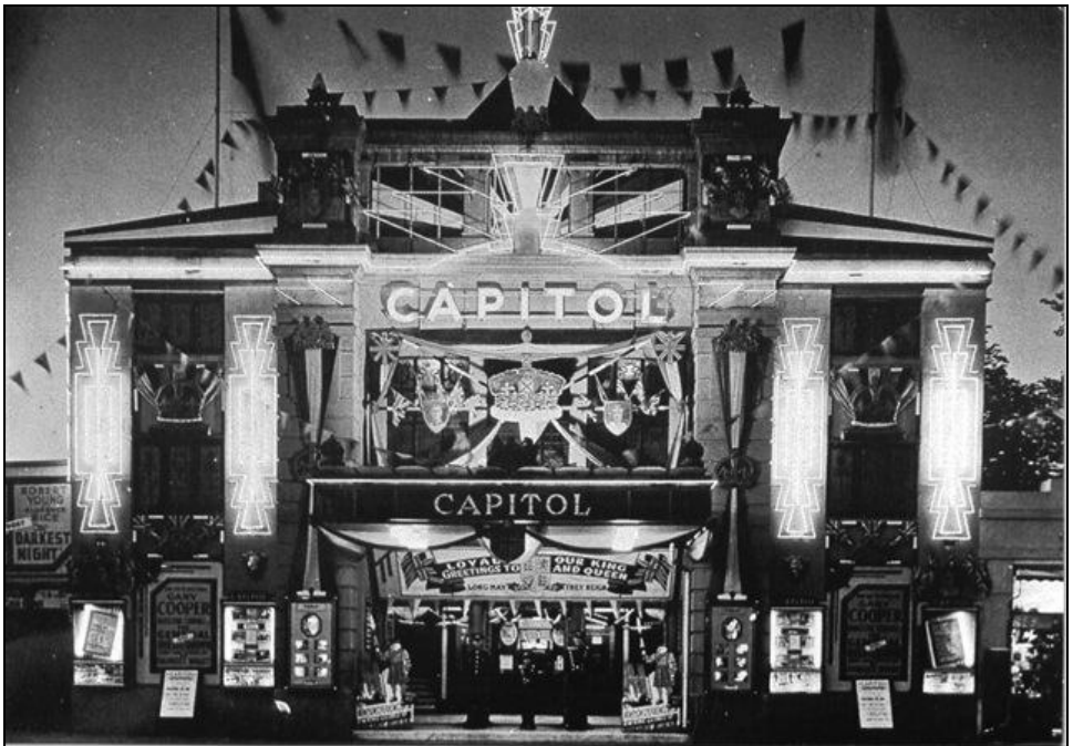
The Capitol Cinema, Walton-on-Thames, decorated for the Coronation of King George VI, in 1937.

In this issue – Blidworth's Scala Cinema / Cecil Hepworth – film pioneer / Newcastle Paramount part 2 / Halifax cinemas - 3 / Notes & Queries